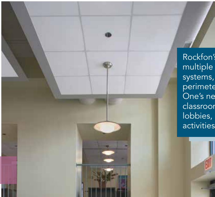
Rockfon's team provided multiple ceiling suspension systems, panels and perimeter trim for Club One's new and renovated classrooms, offices, lobbies, corridors and activities areas.

Club One's combined space now offers gymnasiums, weight rooms, locker rooms, classrooms, a library, a technology center, a dance room, a craft room, a new science laboratory, expanded kitchen amenities, as well as modernized infrastructure, universal design enhancements and updated finishes. The entire facility also is now fully accessible and compliant with the Americans with Disabilities Act (ADA).